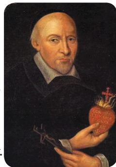
St. John Eudes