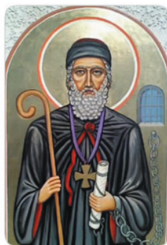
Mar Abba the Great

has recently joined the faculty at JP Catholic as a professor of philosophy. The Chaldean Catholic Eparchy of Saint Peter The Apostle, with its seat in El Cajon (right outside San Diego), is relatively new, created by Pope John Paul II in 2002. The seminary is named for an important sixth-century saint, Mar Abba, a Patriarch of the Church of the East. II